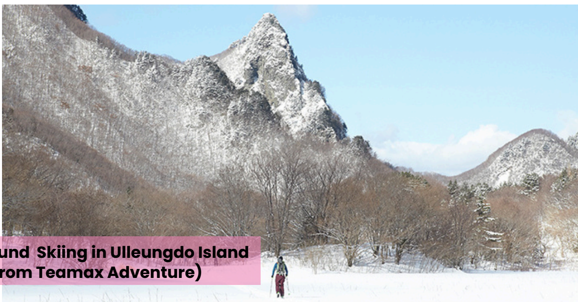
Background Skiing in Ulleungdo Island (Image from Teamax Adventure)

Teamax Adventure, a tour operator specialising in adventure travel, provides tours that are ideal for upper-intermediate skiers. Their “Backcountry Skiing in Ulleung Island” tour includes outdoor experience, hiking, and skiing in the snowy, steep volcanic island. More information can be found at the website ( TEAMAX ADVENTURECo.Ltd ).