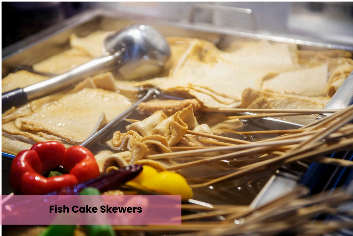
Fish Cake Skewers

While visiting the attractions listed above, visitors will find nearby restaurants and food carts selling Korean winter foods. Although these foods are available all year, many Koreans regard certain items as winter treats. Particularly in the case of street food where you will find an extensive choice of food carts selling winter snacks. Without having to plan and search, people can stop by whenever they feel hungry or cold. Bungeoppang is the most typical winter street food. The fish-shaped pastry is filled with either hot sweetened red bean paste or custard cream. Similarly, hotteok can be described as a Korean pancake filled with syrup made of brown sugar and cinnamon and sometimes with the addition of seeds or nuts. For people who want savoury foods, eomuk, or fish cake skewer, is highly recommended. Fish cake is made of dough consisting of flour, fish and spices. It is typically served with hot soup and soy sauce.