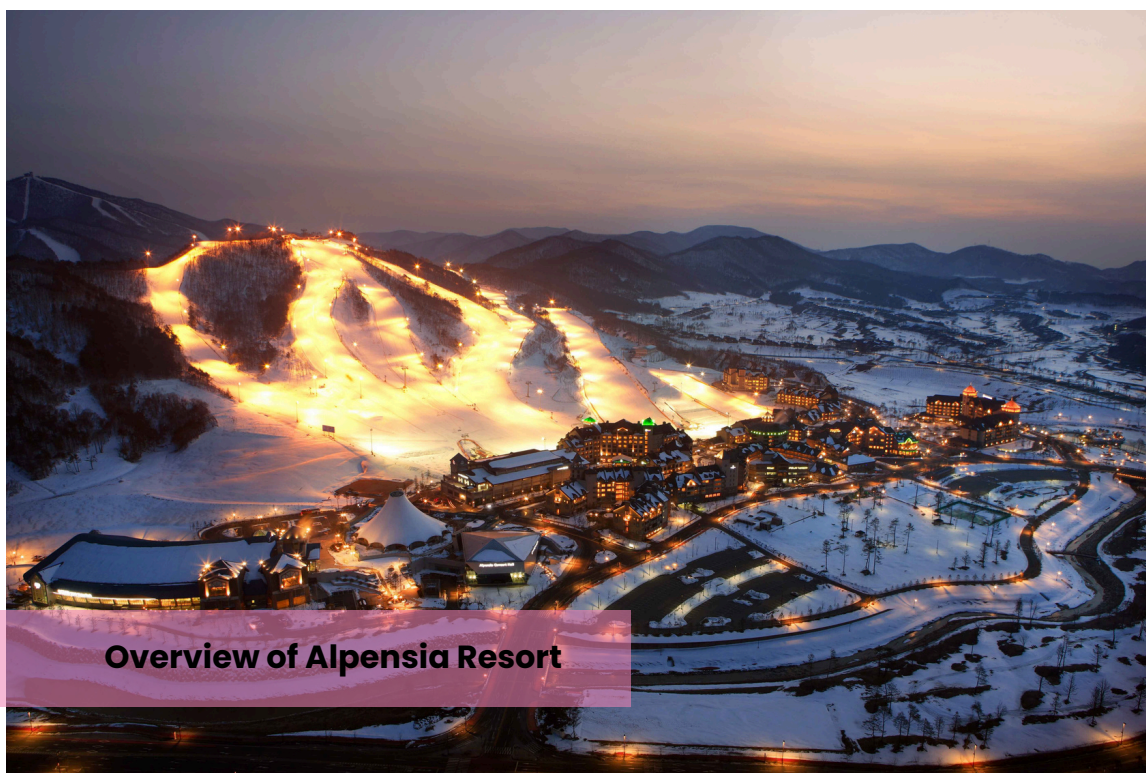
Overview of Alpensia Resort

While skiing can be experienced in many other countries, world-class resort facilities make Korea stand out from other ski destinations. Besides ski slopes, many resorts offer a wide range of relaxation, culinary, and entertainment services, such as spa & sauna, karaoke rooms, and arcades, providing an opportunity for travellers to socialise and have fun. Also, many resorts have state-of-the-art snowmaking machines. This, combined with naturally produced snow, guarantees sufficient volume and quality throughout the ski season.