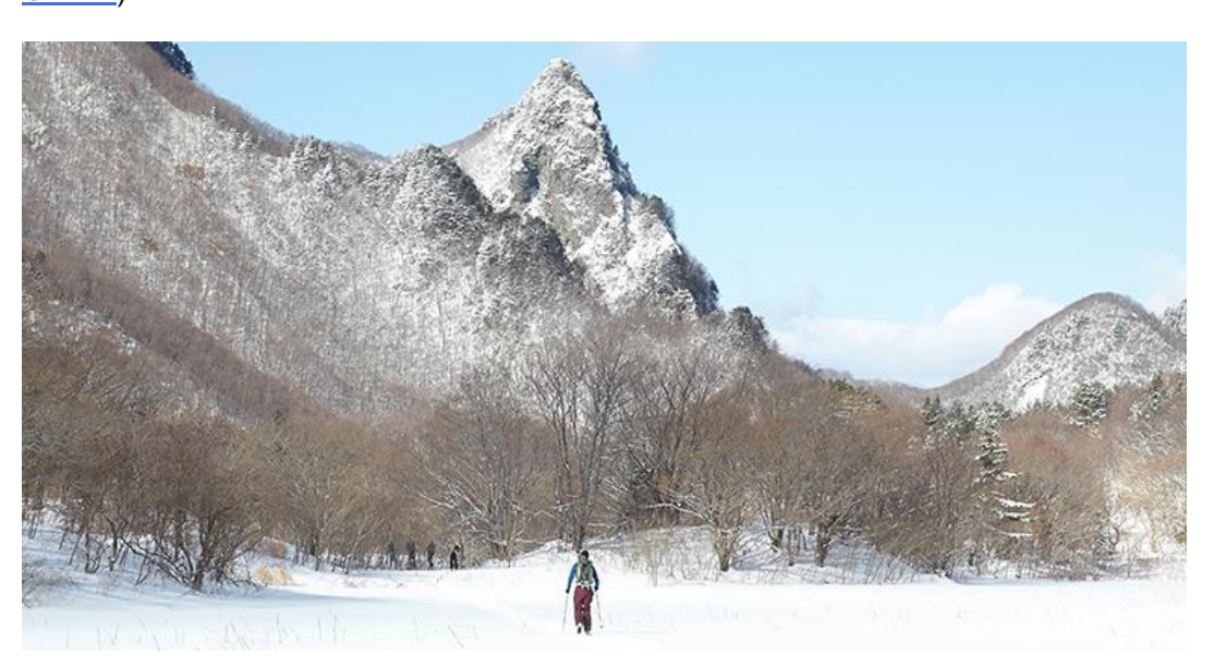
Background Skiing in Ulleungdo Island

Teamax Adventure , a tour operator specialising in adventure tours, provides well-organised tours that are ideal for upper intermediate skiers. Their 'Backcountry Skiing in Ulleung Island' tour includes outdoor experience, hiking, and skiing in the snowy, steep volcanic island. For more information, visit the information at the website (<u>TEAMAX ADVENTURE</u> <u>Co.Ltd</u>).