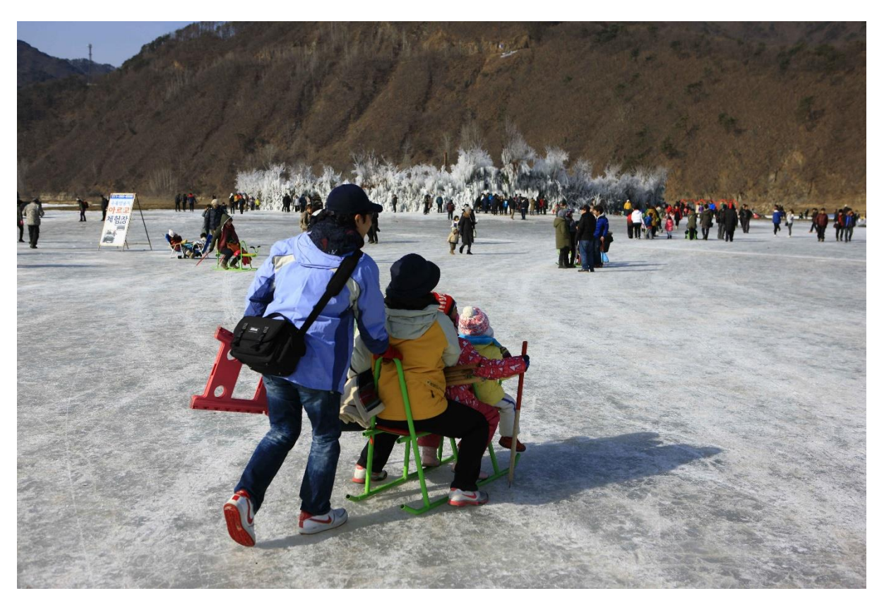
Inje Icefish Festival