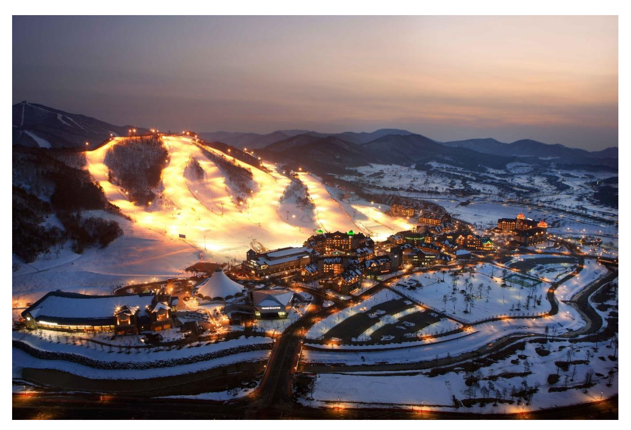
Overview of Alpensia Resort