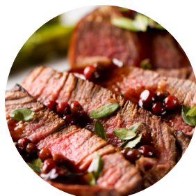
Grilled Tenderloin Steak