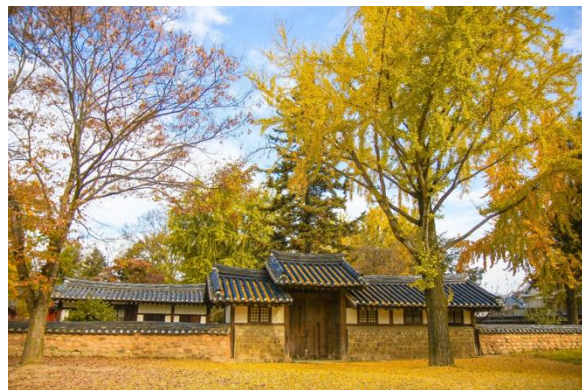
Gyeonggijeon Shrine, Jeonju, Jeollabuk-do