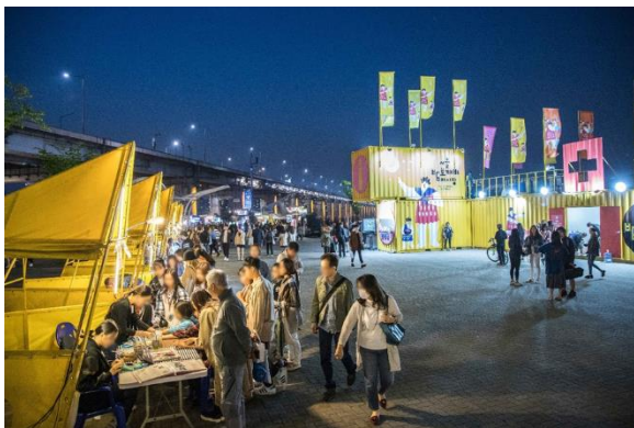
Night Market at Banpo Han River, Seoul

Koreans try to make the best out of the short, ideal seasons. Local parks host various music festivals and night markets , which can provide great insight into local lives. Also, many places attract people to scenic arrangements of cherry blossom trees (spring) and ginkgo trees (autumn).