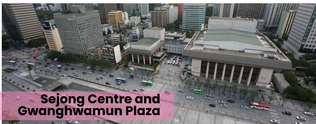
Sejong Centre and Gwanghwamun Plaza

Other than places listed above, there are many art centres and art halls in Korea. For people who want to engage with the theme of Stage Fighter, Seoul Arts Centre in Seocho-gu, Seoul and Sejong Centre in Jongro-gu, Seoul are renowned venues for ballet and contemporary dance.