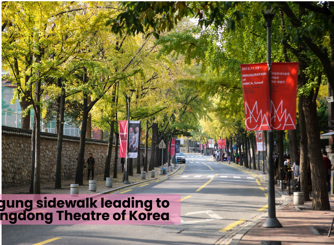
Deoksugung sidewalk leading to Jeongdong Theatre of Korea