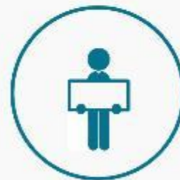
Meet & Greet