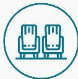
Neighbor Free Seat